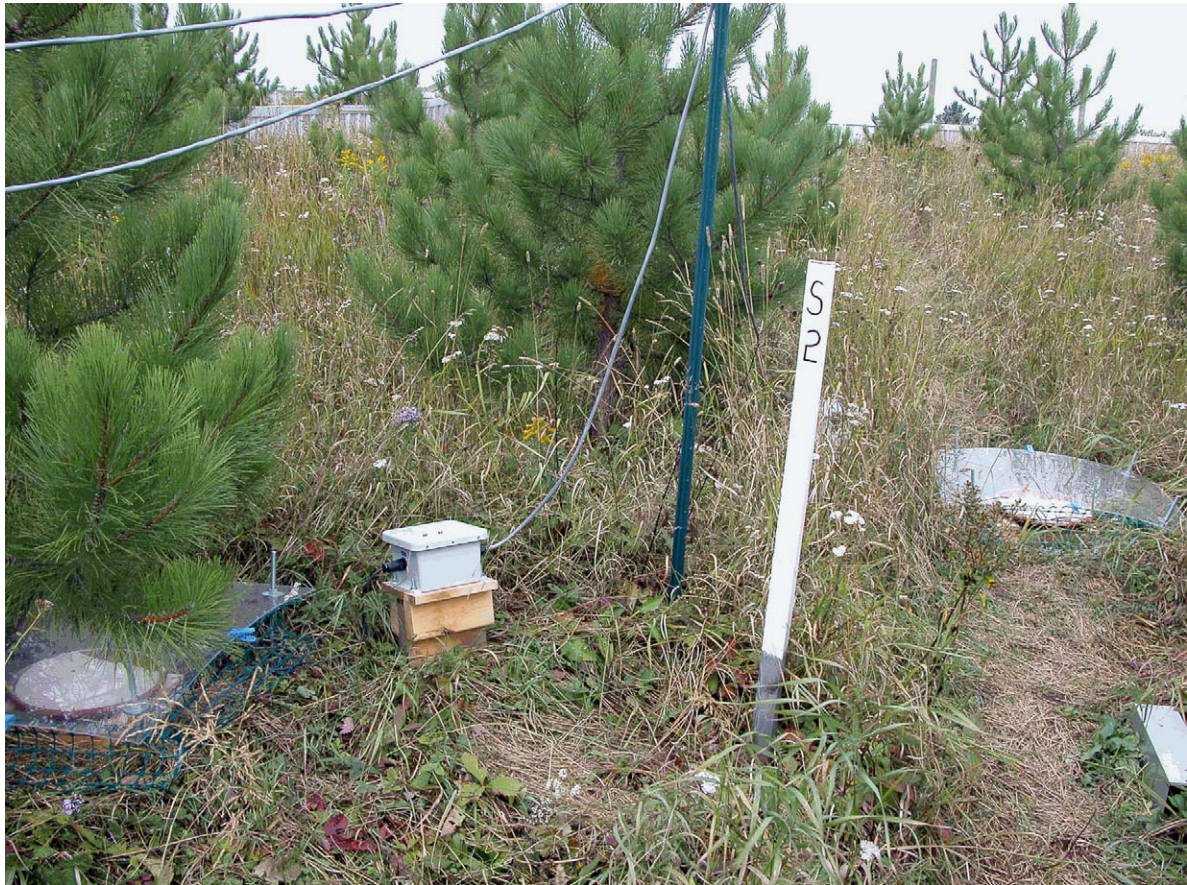
PLATE 1. One pair of replicated “covered” (left) and “open” foraging patches used to assess giving-up densities of foraging meadow voles in an enclosed old-field habitat during summer 2008. An antenna under each foraging tray identified voles injected with radio-frequency identification tags. Data were stored in field recorders (small white box), then downloaded to a laptop computer. Acrylic covers protected the trays from rain and wind.

previous vole experiments unambiguously documented active habitat selection, all bolster our conclusion.